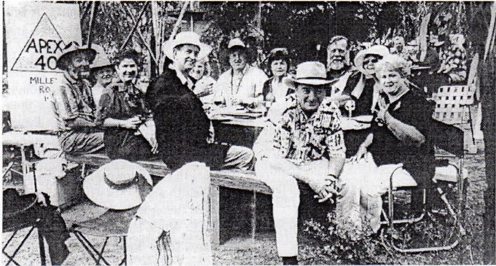
A newspaper photograph of the Sunraysia group at Meringur Pioneer Park.

NORWESTERS: Held a 'Christmas in July' dinner at the Keilor Hotel – no news since then.